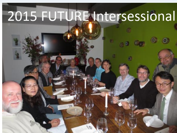
2015 FUTURE Intersessional