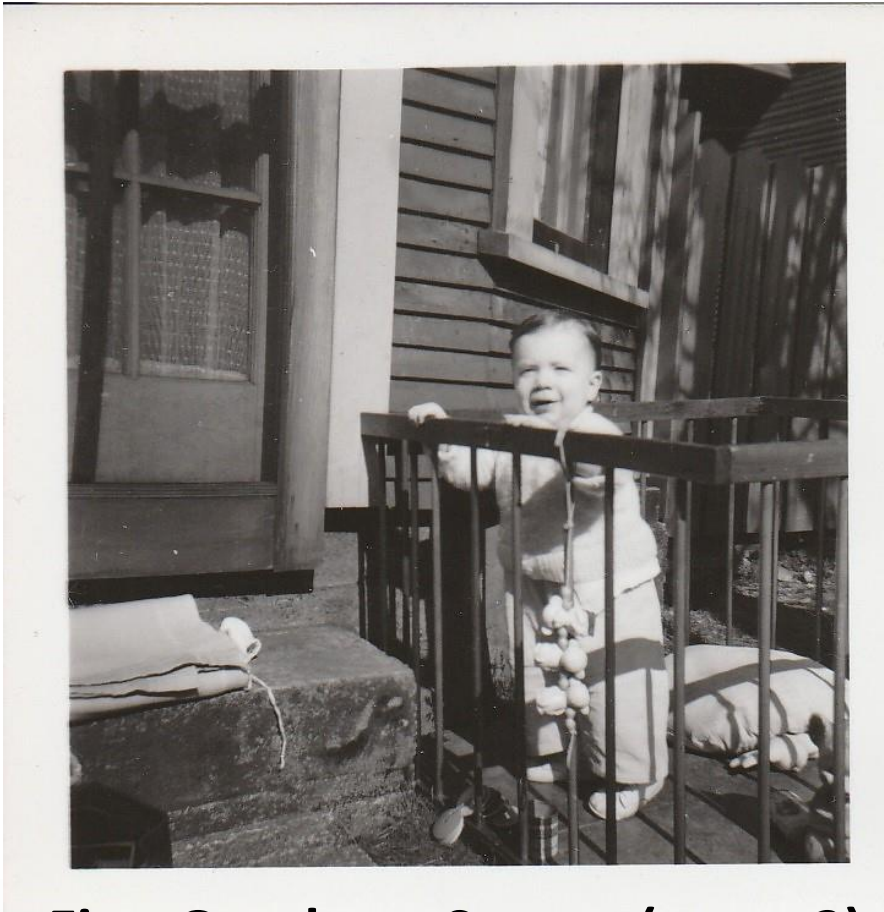
First Quadrant Survey (~ age 2)