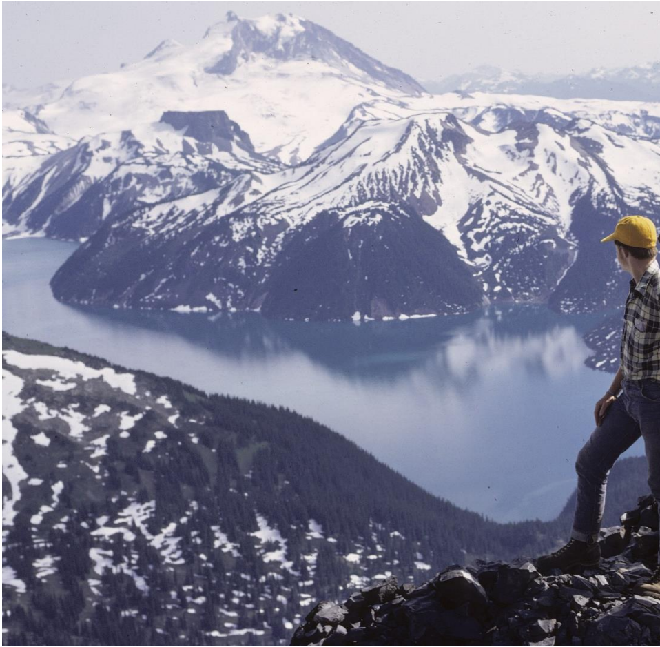
Hiking Garibaldi Lake near Whistler