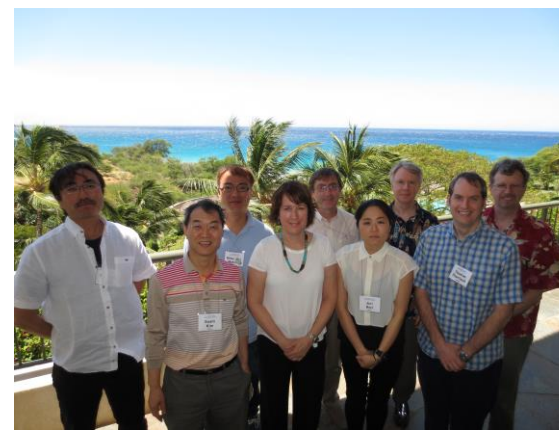
MarWeb Intersessional Meeting, Kona 2014