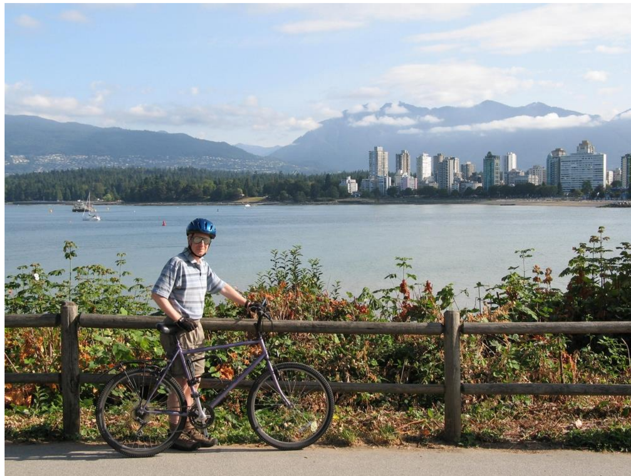
Cycling, Vancouver style