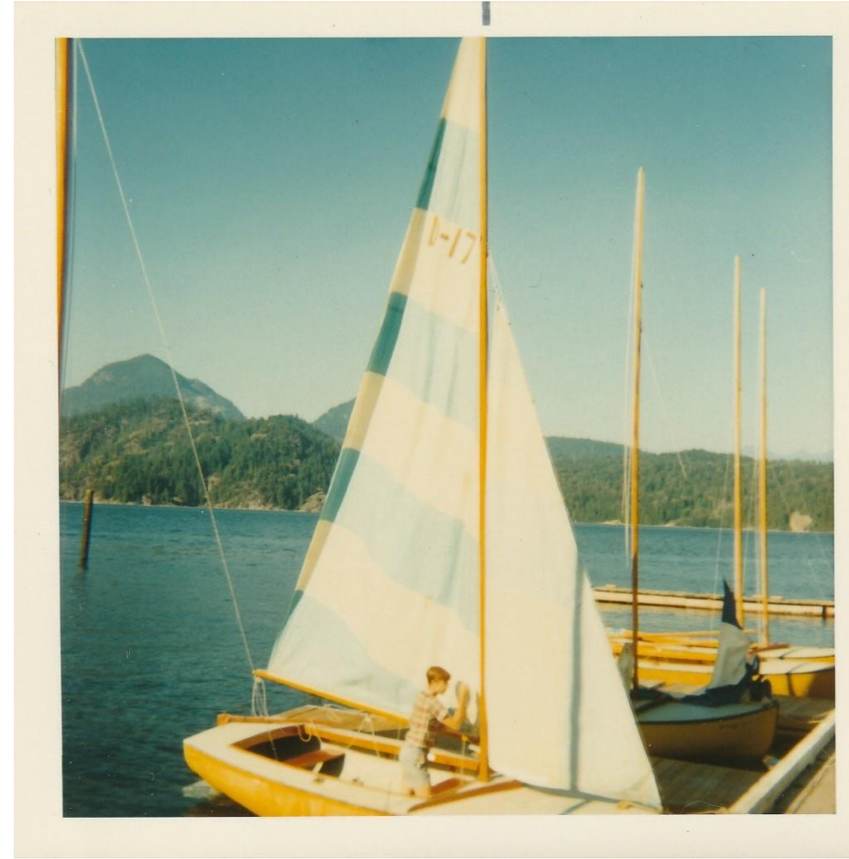
Sailing during high school