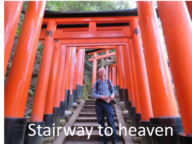
Stairway to heaven