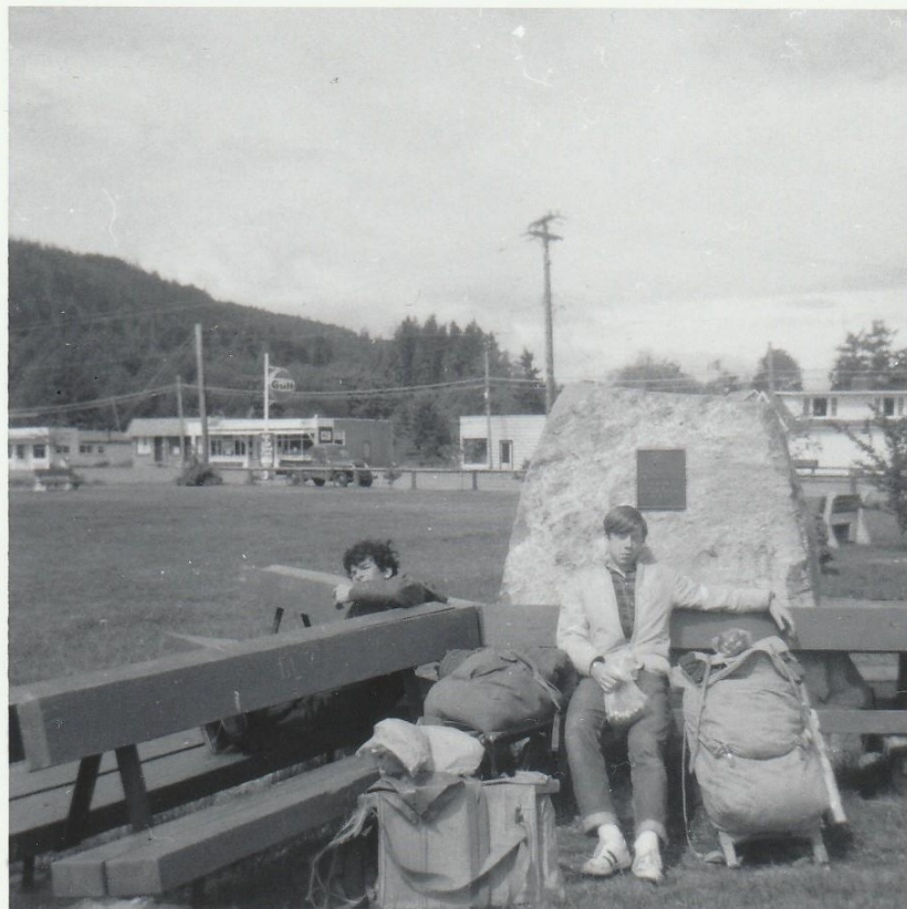
Backpacking Europe as an Undergraduate