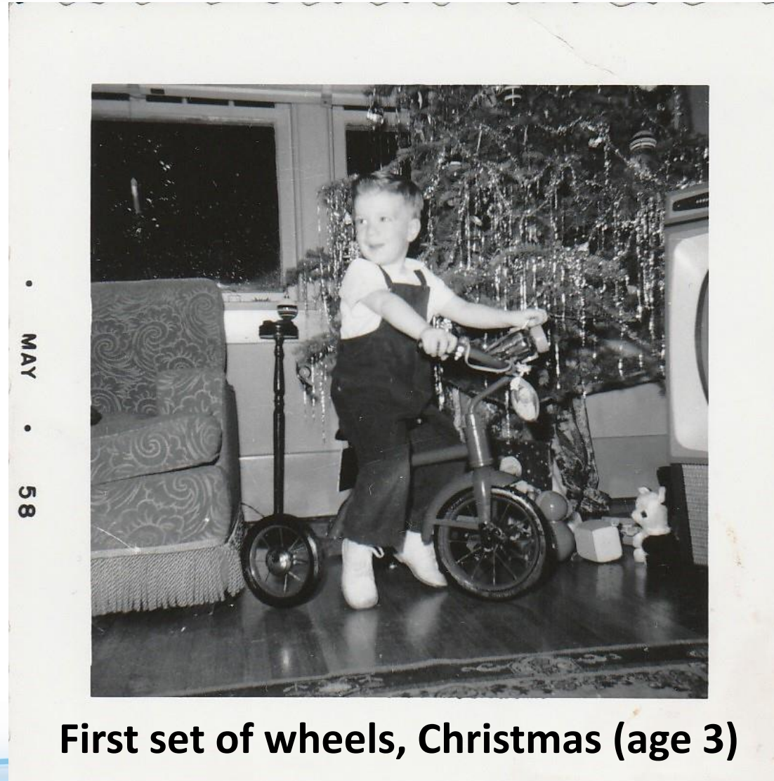
First set of wheels, Christmas (age 3)