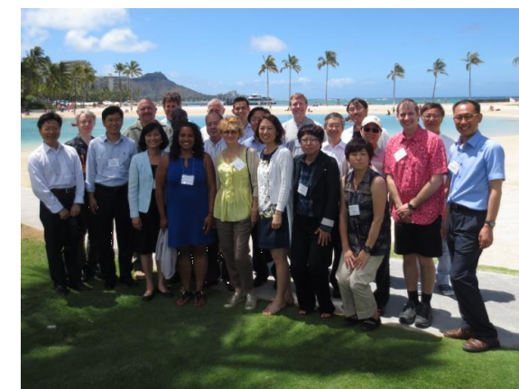
2013 NPESR and WOA Workshop