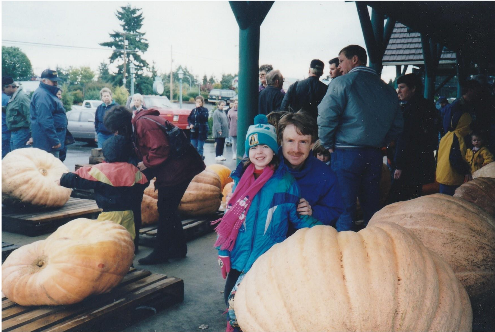
The hunt for the Great Pumpkin