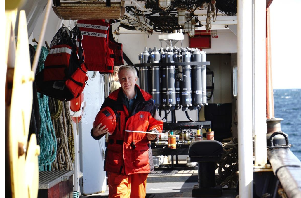
Taking a break from work