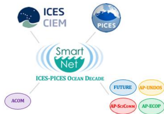
Figure 2: Intersection of SMARTNET activities within ICES/PICES infrastructure: PICES FUTURE Scientific Steering Committee, and Advisory Panels on UN Decade of Ocean Science, Science Communications, and Early Career Ocean Professionals; and ICES Advisory Committee (ACOM).

marine & coastal resources and the communities that depend on them. These objectives are closely linked to the Ocean Decade’s ten Challenges and seven Desired Outcomes , with a particular emphasis on ‘A Productive Ocean’, ‘A Healthy and Resilient Ocean’, ‘A Predicted Ocean’, and ‘An Inspiring and Engaging Ocean’. More broadly, SmartNet objectives are congruent with several of the UN’s Sustainable Development Goals : SDG 14 (‘Life Below Water’), SDG 13 (‘Climate Action’), SDG 2 (‘Zero Hunger’) and SDG 5 (‘Gender Equality’).