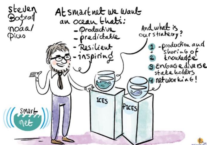
Figure 4: Sketch from the SMARTNET ‘Ocean We Want Survey’ satellite event at the Ocean Decade Conference in Barcelona, Spain, April 2024.

SMARTNET has also contributed to knowledge generation in the Ocean Decade through its global survey on the ‘ What is the Ocean We Want? ’. The refrain of the Ocean Decade is ‘The Science We Need for the Ocean We Want’. The SMARTNET-led survey seeks to understand ‘The Ocean We Want’ relative to the 7 Ocean Decade Outcomes, recognizing that there are widely different priorities and