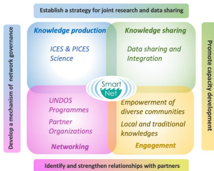
Figure 3: The strategic framework governing the SMARTNET Global Knowledge Network.

The objectives and governance structure described above have guided the activities of SMARTNET since its Ocean Decade endorsement in 2021, leading to substantial progress in fulfilling its goals.