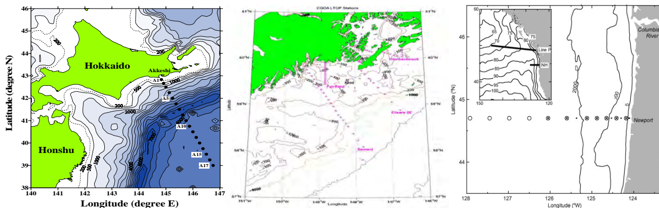
Fig. 2 Maps showing the location of the three MEMIP test bed locations: the A-line off Hokkaido Island, Japan (left), the Gulf of Alaska (GAK) line off Seward Peninsula, northern Gulf of Alaska (middle), and the Newport Hydrographic (NH) line, off Oregon, U.S.A. (right).

goals of MAREMIP and MEMIP seemed complementary and not redundant or duplicative.