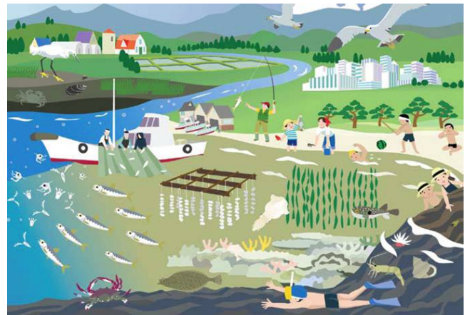
Fig. 1 Image of sato-umi (coastal village and sea): fishing villages, fisheries operations, aquaculture, swimming, shellfish gathering, sport fishing (angling), nature observation, urban area, etc. (source: United Nation University (2010), Japan Satoyama Sato-umi Assessment).

resulted in high marine productivity and biodiversity (Makino 2011, p. 126; Makino and Fluharty 2011). The activities to re-establish and promote the recovery of sea grass beds that have been undertaken by local community members near Yokohama are one example. Comparable types of sea grass and kelp restoration activities have been proposed by local communities in the Strait of Georgia, Canada. The Japanese government has undertaken integrated studies to assess the contributions of social, cultural, economic, and ecological aspects in sato-umi type projects in Japan (Yanagi 2012).