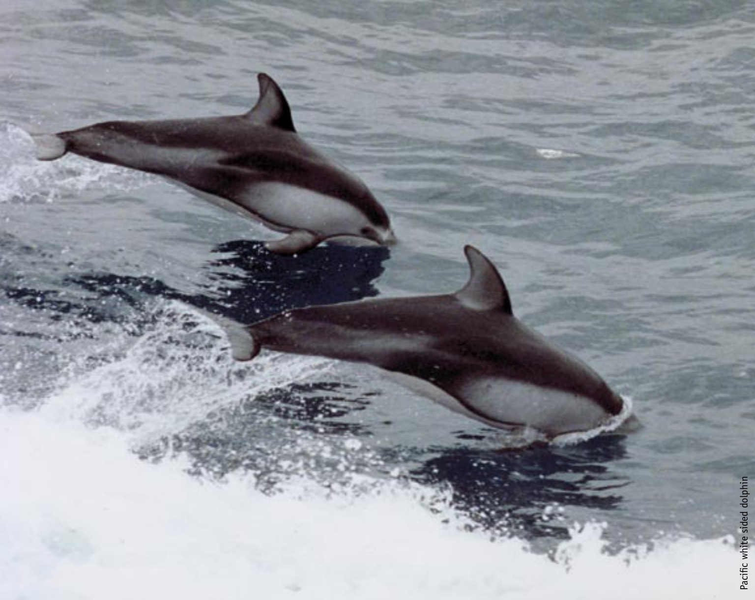
Pacific white sided dolphin

leads to fish production versus microbial-based food webs that produce jellyfish. Since gelatinous zooplankton are particularly difficult to sample quantitatively, and to capture live for physiological studies, the potentially contrasting importance of finfish versus gelatinous zooplankton food webs remains an important unknown. Resolution of this problem is likely to require new non-destructive, but rapid sampling methods.